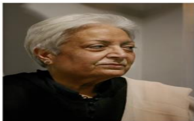
Zarina Hashmi

Hashmi's work often explores themes of home, displacement, and borders. She was particularly interested in the impact of partition on India and Pakistan, and her work often reflects on the loss and displacement that resulted from this event.